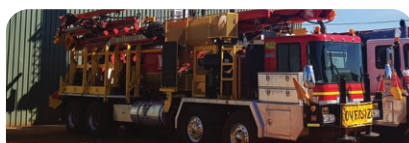
RIG 02 – Versa-drill 2000ADP