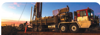
RIG 01 – Versa-drill 2000ADP

Our fleet of modern, low usage drill rigs and ancillary support equipment are maintained to the highest standard and meet the most stringent mine site specifications to increase safety and reduce unnecessary downtime.