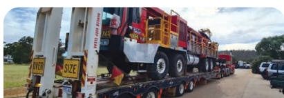
RIG 04 – Versa-drill 2000NG