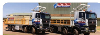
Ancillary Support Equipment