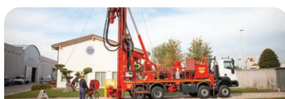
RIG 05 – Fraste FS500