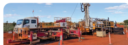
RIG 03 – Versa-drill 2000NG